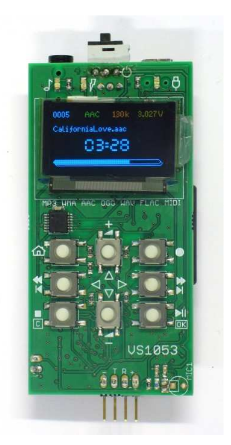
Figure 1.1: VS1053 USB Hi-Fi Player Prototype

Functionality of the player can be customized using a boot EEPROM.